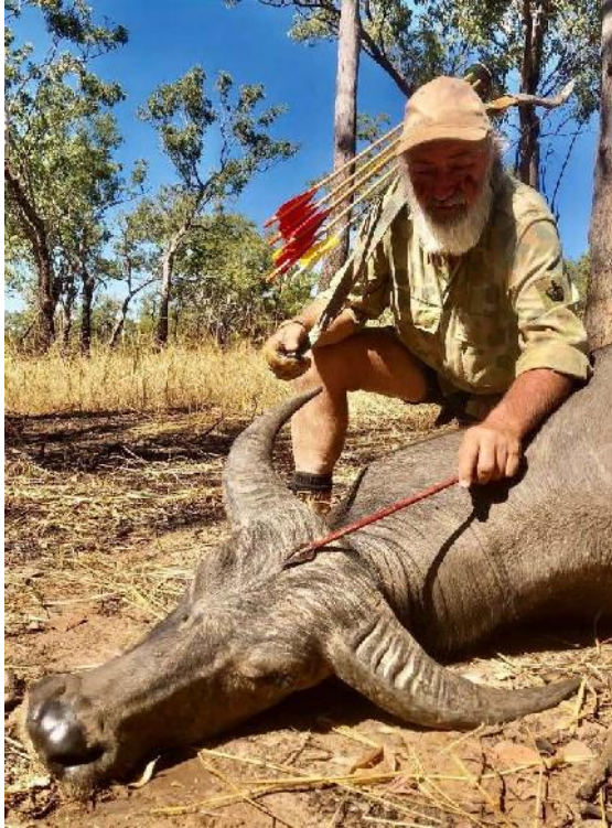
The two Dave's and their NT traditional buff.

running, tree climbing and a few high-pitched screams that may have called in a fox if there were any in the area!! To relax after a stressful hunt, Whiting headed to Strathburn and knocked over a few cranky Cape York boars as well scoring between 23-25 6/8.